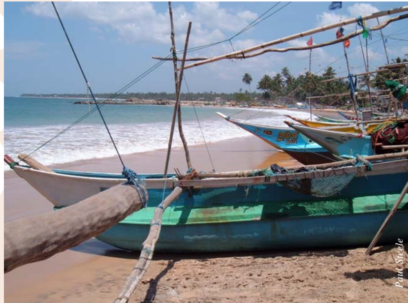
tsunami near Hikkaduwa, March 2006