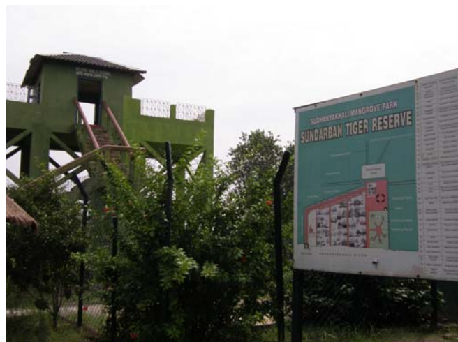
Sundarban Reserve, Kolkata, India

Overall the awareness about the ecological functions and values of mangrove ecosystems remains low among decision-makers in Pakistan. A recent study undertaken by us seeks to change this assessment. We found in one