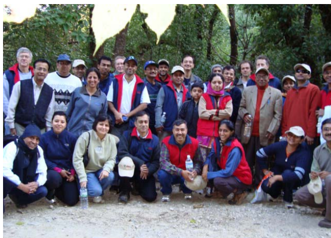
SANDEE Group-Trekking in Phulchoki, December 2008

This study examines household behavior related to fuel wood collection and use. The focus is on identifying the behavioral transition of fuel wood-using households from collection to purchase. The study examines the theory linking households' labor allocation decisions to choice of fuel, and models household decision using a three-stage least squares probit specification. Household's fuel wood choice (purchase/collection) is predicted based on an endogenously determined wage income that depends on the opportunity cost of fuel wood collection. There is also the possibility that at very high levels of income, and in the absence of alternatives to choose from, households may revert back to collecting fuel wood using either their own labor or hired workers. The policy implication of a possible reverse switch is that there may be a need to continue with price subsidies on kerosene and LPG and at the same time create effective institutions for conserving forest commons.