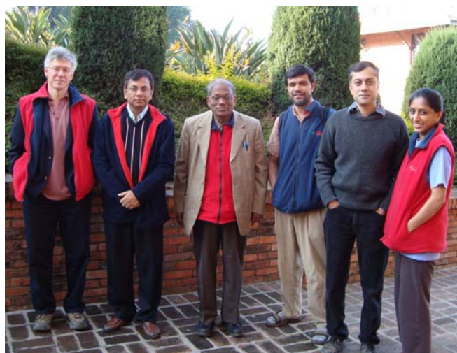
SANDEE's Research Advisors, December 2008